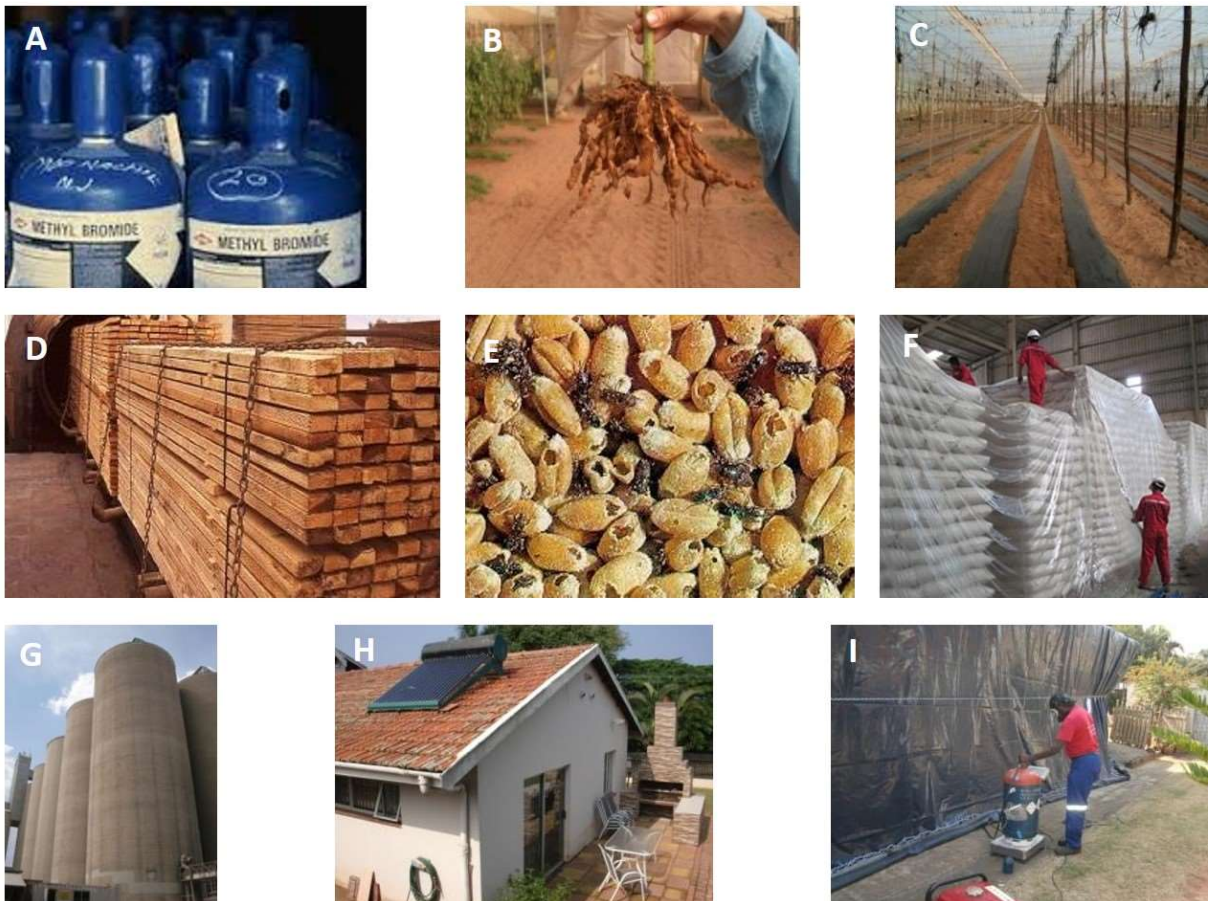
Figure 2. Soil (A, B, C), commodities (D, E, F), and structures (G, H, I) fumigation with methyl bromide

MB is a broad-spectrum pesticide used to control soil-borne pathogens, insects, nematodes, and weeds. MB is used in the following areas: 1) Pre-plant fumigation of soil to control soil-borne pests and diseases in the production of some high-value crops, e.g., vegetables, ornamentals, tobacco, and strawberries; 2) Fumigation of some commodities and structures to control damaging pests, and 3) Quarantine and pre-shipment fumigation to prevent the spread of pests and diseases (Phytosanitary measures) (Figure 2). About 50 to 95% of the MB bromide injected enters the atmosphere, contributing to the thinning of the ozone layer and allowing increased UV radiation to reach the Earth's surface, greatly impacting man and its environment [3].