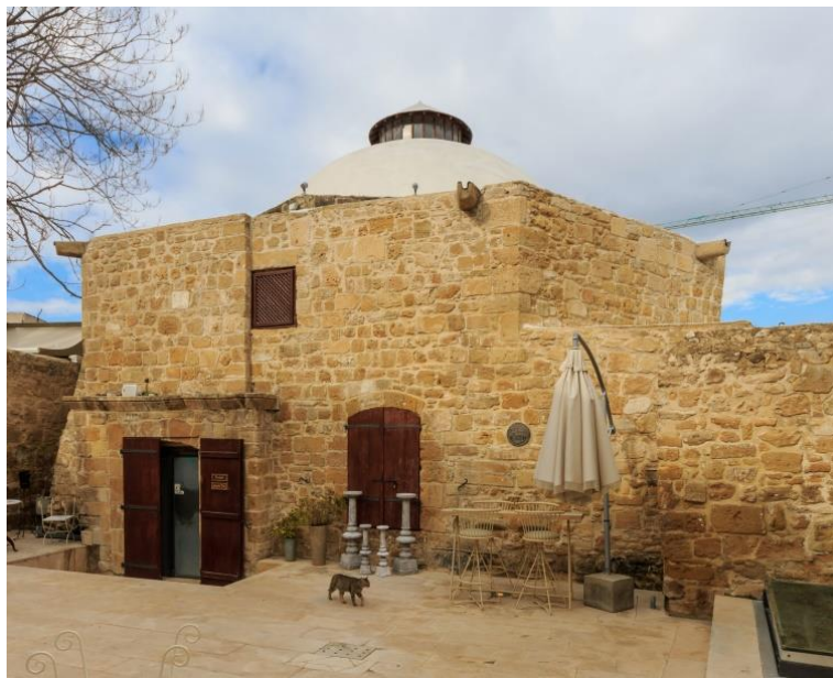
Figure 5: Hamam Omerye, Nicosia.

Hamam Omerye (Fig. 5) is a historical public bathhouse located in the old city of Nicosia, Cyprus [20]. It was built during the Ottoman era in the 16th century and has since been renovated and restored multiple times. The hamam has many structural characteristics that are unique and distinctive. It is primarily constructed of stone masonry, which is a durable and sturdy building material. The Hamam Omerye has several barrel-vaulted ceilings, which are created by curving a series of arches. The barrel-vaulted ceilings provide structural support and help distribute the weight of the building. The roof is supported by timber roof trusses, which are triangular-shaped structures, made of wood. The timber roof trusses help distribute the weight of the roof and provide structural stability. The walls are reinforced with buttresses, which are projecting support structures that help distribute the weight of the walls and the roof. The Hamam Omerye has several stone columns that support the vaulted ceilings. The columns are constructed of stone blocks, which are stacked on top of one another and held together with mortar. It has several arched openings, which are created by curving a series of stones or bricks. The arched openings help distribute the weight of the walls and provide structural stability and inside it has an underground cistern that collects rainwater. The cistern is constructed of stone and is reinforced with arches and buttresses.