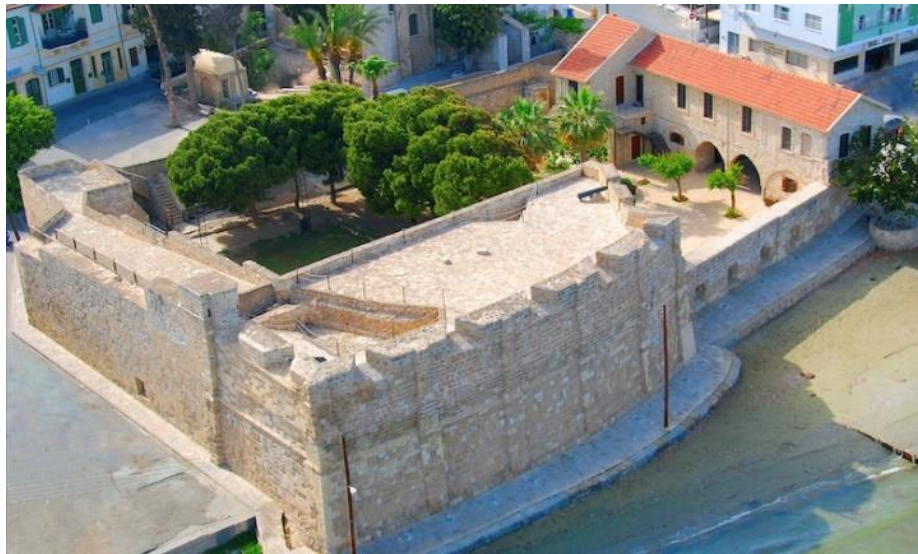
Figure 2: Larnaca Castle [17].

Larnaca's Castle (Fig. 2), also known as Larnaca Fort, is a medieval castle located on the southern coast of Cyprus [17]. The castle is characterized by its sturdy, rectangular structure, which is built from limestone blocks. The walls of the castle are up to 2.5 meters thick, and the entire structure is surrounded by a moat, which was once filled with sea water. The castle has two floors, with a central courtyard that is surrounded by various rooms and halls.