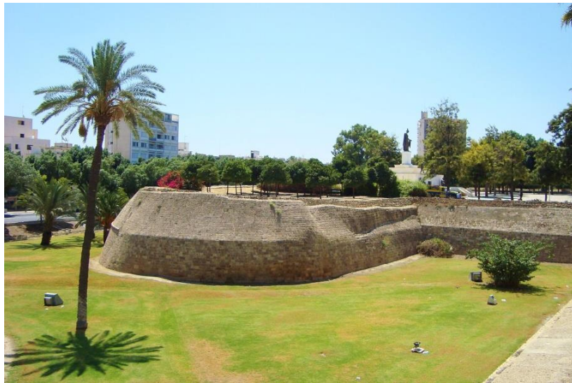
Figure 1: The Venetian Walls of Nicosia.