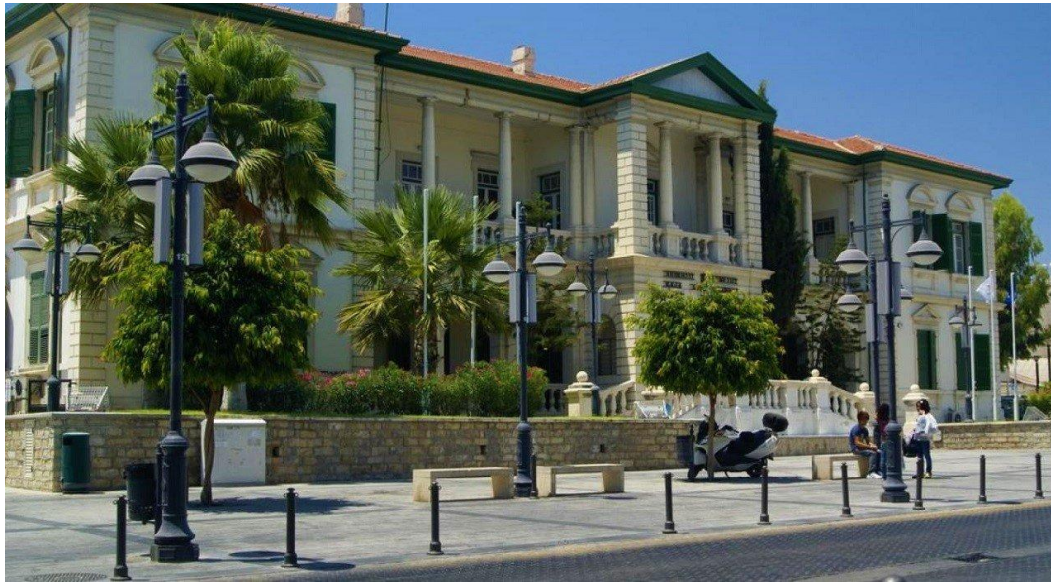
Figure 9: Administration Offices, Limassol [24].