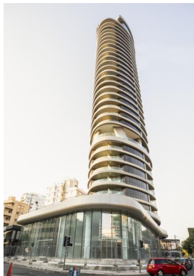
Figure 13: 360 Nicosia [28].

The 360 Nicosia Tower (Fig. 13 ) is located in Nicosia [27]. With a height of 135 meters and 34 floors, it is one of the tallest buildings in Cyprus. All the above three structures have been constructed using reinforced concrete and they have been designed to meet the relevant building codes and standards, including the seismic design requirements of Eurocode 8.