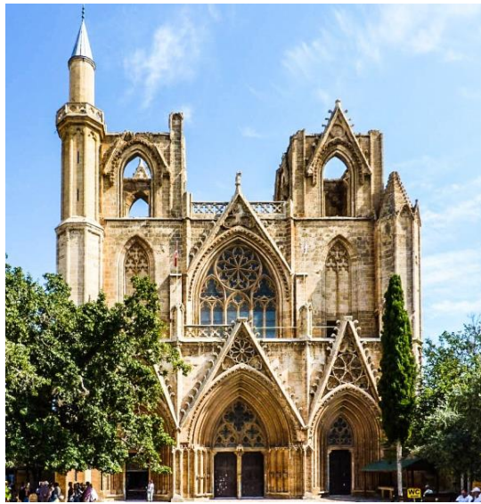
Figure 3: Church of St. Nicholas in Famagusta [18].

shape and is topped with a pointed spire. The tower is decorated with a variety of ornate carvings and has several openings for the bells.