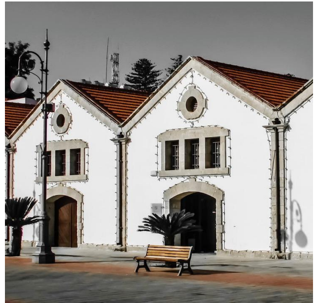
Figure 8: Municipal Art Gallery and Museum of Paleontology, Larnaca [23].