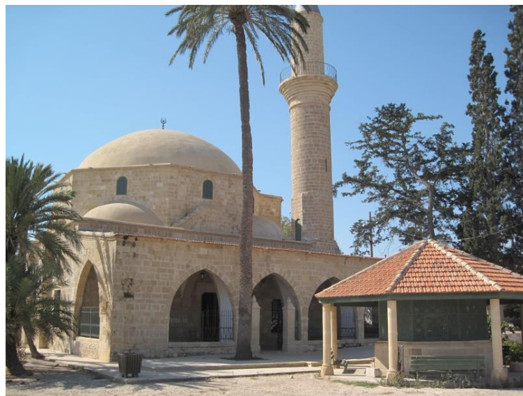
Figure 4: The mosque has a large rectangular courtyard, which is surrounded by a low wall. The courtyard is paved with stones and is used for prayer and other religious activities [19].

Hala Sultan Tekke (Fig. 4) is a historic mosque located in the city of Larnaca, Cyprus [19]. The mosque is built on the west bank of Larnaca Salt Lake and is considered one of the most important holy places in the Islamic world. The mosque is built on a rectangular foundation made of local stone and its walls are made of thick stone blocks and have no windows. This is because Islamic tradition prohibits the depiction of living beings in religious buildings. The building has a central dome, which is larger than the four smaller domes located at each corner of the building. The domes are made of brick and covered with red tiles. The interior of the mosque is supported by columns made of stone. The columns are arranged in a square pattern around the central dome. The mosque has a large rectangular courtyard, which is surrounded by a low wall. The courtyard is paved with stones and is used for prayer and other religious activities.