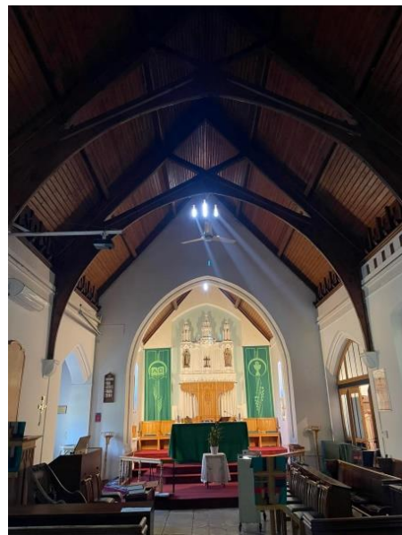
Figure 7: St. Paul's Anglican Cathedral, Nicosia [22].