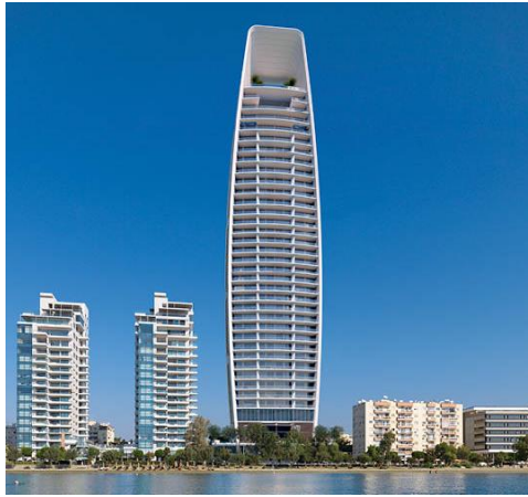
Figure 11: One, Limassol [25].