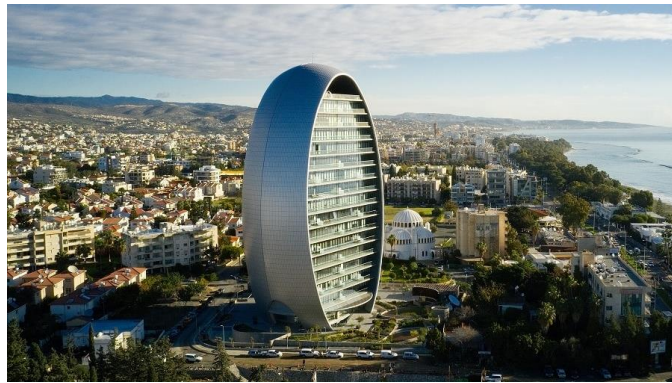
Figure 12: The Oval, Limassol [26].