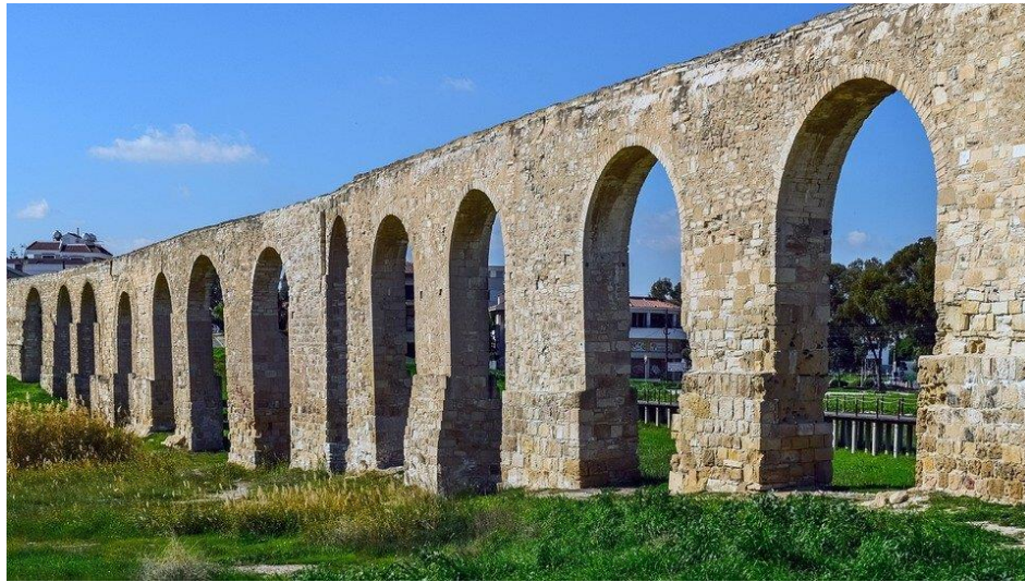
Figure 6: Kamares Aqueduct, Larnaka.