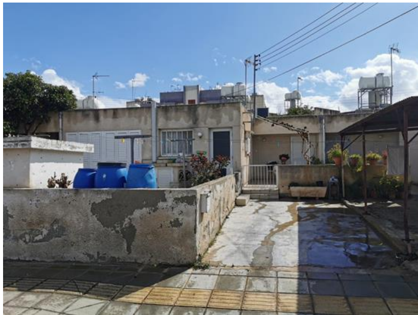
Figure 10: Typical residential refugee house (source, G. Xekalakis own work).