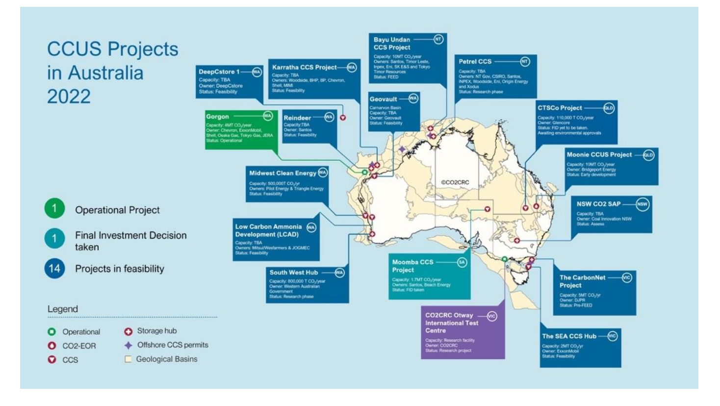
Figure 1: CCUS projects in Australia

Depending on the literature consulted, the ZeroGen project was either an overwhelming success [37], or a spectacular failure [38]. Although the project was due to progress to the demonstration phase by 2015, with a full-scale plant by 2020, the ZeroGen project was placed in liquidation in 2011, and officially cancelled. The full history of the ZeroGen project, including the failures, is an important lesson for carbon capture projects, and that full-scale deployment of a project is preferable to trial phase [36].