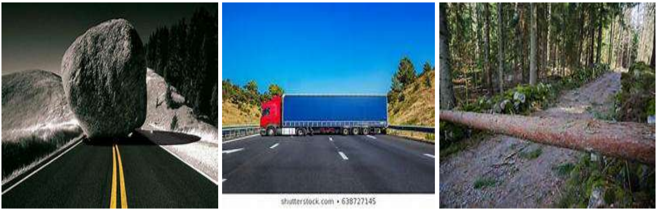
Figure 1: Steadfast obstacle on the road suddenly detected in front of the moving vehicle.

As is known, two major phases of the stopping process are being distinguished [1-4]: the first one, the pre-braking phase, includes the driver's perception (decision making) time and the reaction time, and is characterized by the more or less constant speed of the vehicle; the second one, when actual braking takes place, is characterized by a constant deceleration, and it is at this phase when an adequate brake power is important. In the analysis that follows, a probabilistic approach is applied to assess the level of this power needed to avoid obstruction with a suddenly detected steadfast obstacle in front of the moving vehicle. A situation when the only way to avoid an accident is by using brakes (see, e.g., Fig. 1) is addressed. The objective of the analysis is to establish the probability of the possible obstruction. The obtained results can be used to determine this probability when selecting the power of the brake system. The analysis is an extension and a modification of the approach considered earlier for a spacecraft landing on a planet [5].