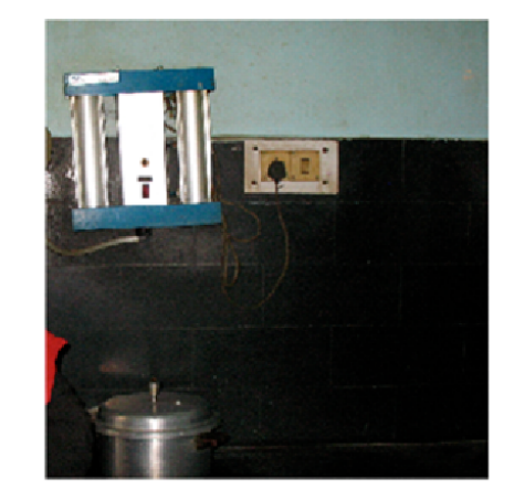
Figure 2: Pressure cooker and ultra-violet machine.