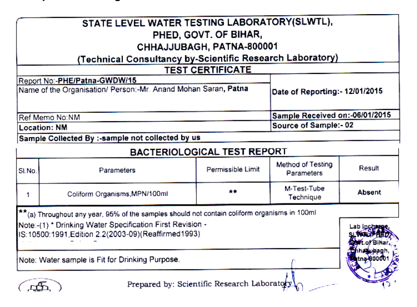
Table 6: Results of the Sample from Ganga River at Patna after One Whistle

The last row in the Table 5 shows that the Ganga water is not fit for drinking as the water quality index is greater than 12(last column and second row from the bottom). The acceptable range is between 0 to 10.