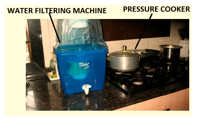
Figure 1: Pressure cooker and water filtering machine.

Figure 1 shows a water filtering machine as well as a pressure cooker where water is heated after it is filtered. Figures 2 and 3 show RO as well as an ultra violet machines.